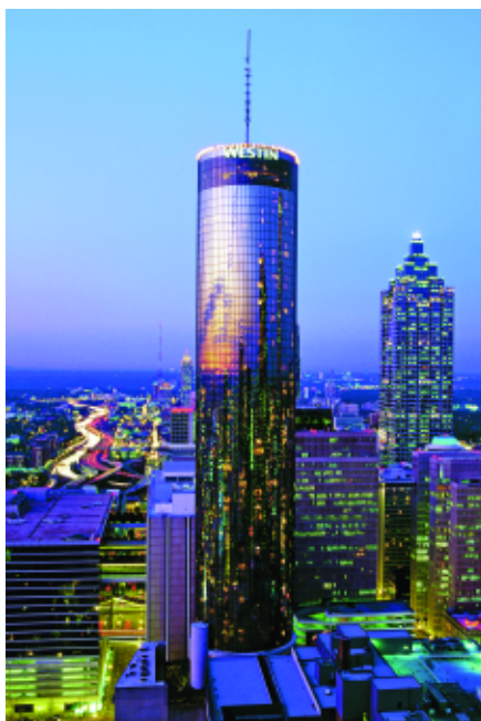
Westin Peachtree Plaza in Atlanta

With 300-plus education sessions at the 2010 Annual HIMSS Conference & Exhibition, March 1-4 in Atlanta, healthcare professionals of all disciplines and levels have boundless opportunities to learn strategies and tactics to affect change in a dynamic industry.